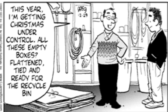
© GEC, Inc./Dist. by UFS, Inc.